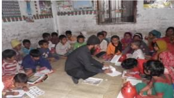
Preprimary age children introduced to literacy & numeracy at SOHAY centre most important to kick off education