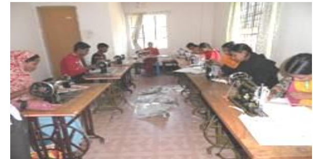
Slum women and children are skilling and preparing them for joining the mainstream economy

SOHAY believes money is the source of power without it sustaining the development is complicated. SOHAY trained 242 slum women and children in different marketable skills. Good news is 45 women bought personal sewing machines joined the economy contributing to the family. The rest are saving money under huge hardship for accessing a sewing machine joining the economy. The programme is runs by individuals' contributions. SOHAY and the slum communities are grateful for their generous support.