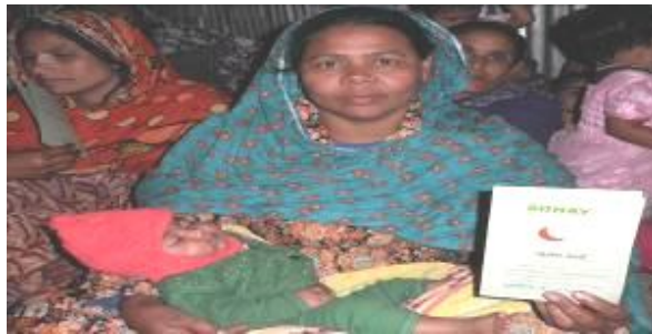
A woman is displaying SOHAY health card